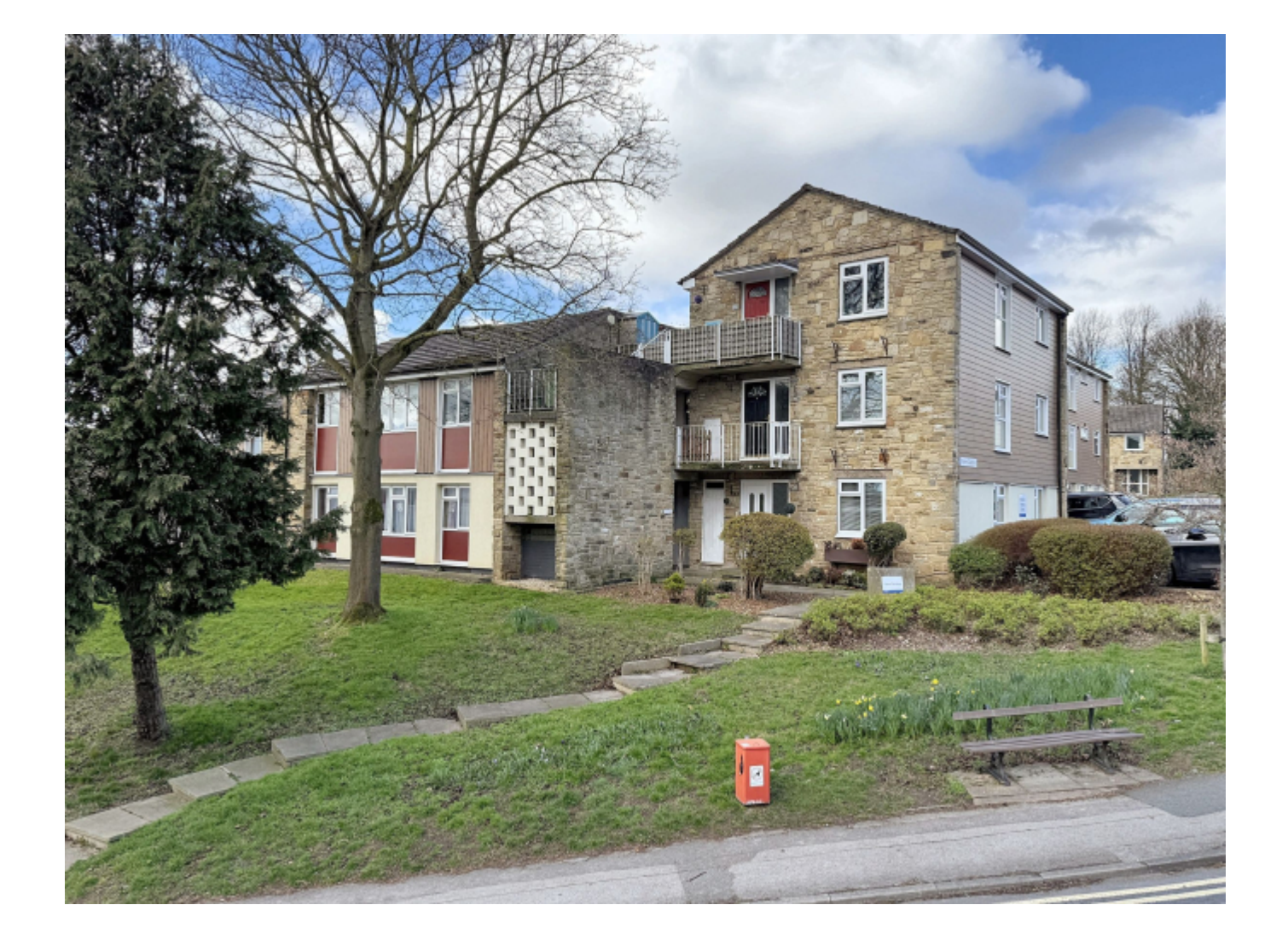
£177,000 Guide Price